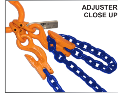
ADJUSTER CLOSE UP

ALL COMPONENTS PROOF-TESTED TO ENSURE END USER SAFETY