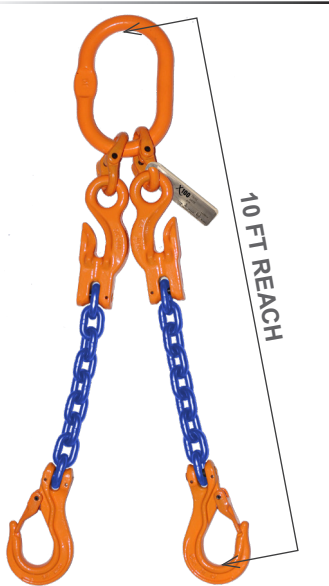
FULLY ASSEMBLED AS SHOWN

ALL COMPONENTS PROOF-TESTED TO ENSURE END USER SAFETY