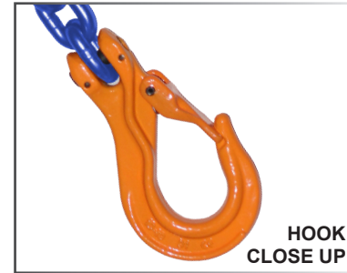
HOOK CLOSE UP