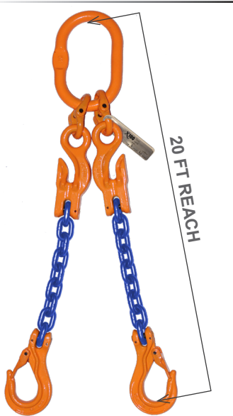
FULLY ASSEMBLED AS SHOWN

ALL COMPONENTS PROOF-TESTED TO ENSURE END USER SAFETY